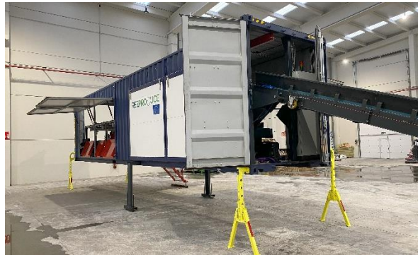
Intelligent sorting machine

Currently, Indumetal Recycling and REVAC , both recyclers' sites are demonstrating and validating tests.