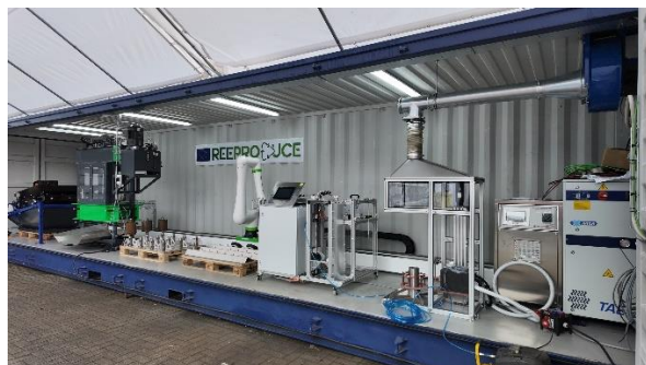
Pilots to extract Nd-based magnets blocks from components

The pilots will be validated at the beginning of 2025.